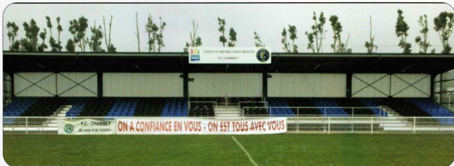
Chambly – Marais Stadium