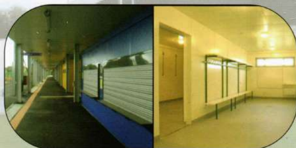
Food courts/Admin offices/Toilets Etc.