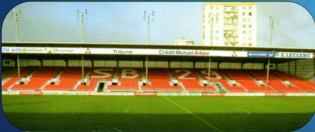
Brest - Francis Le Blé Stadium