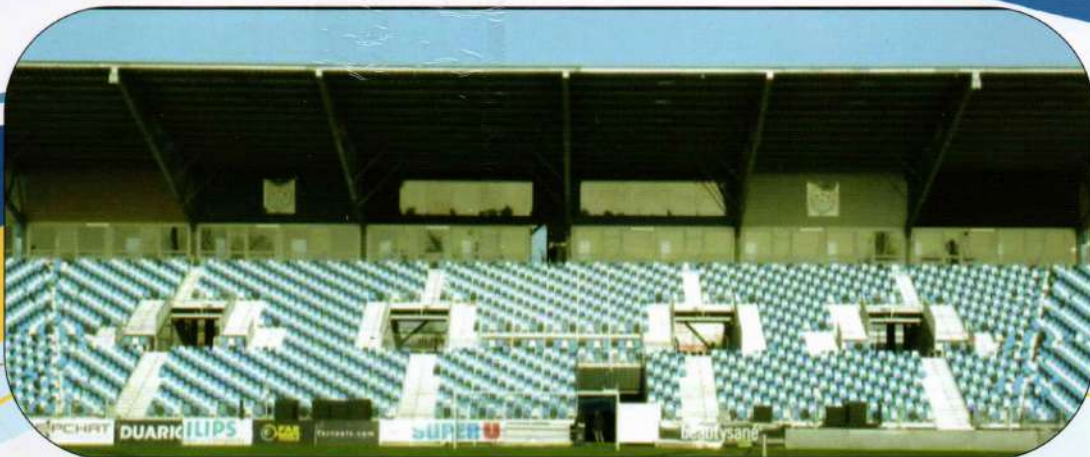
Tours - Vallée du Cher