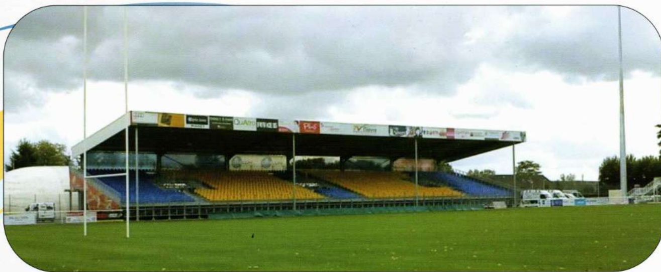
Nevers - Pré Fleuri Stadium